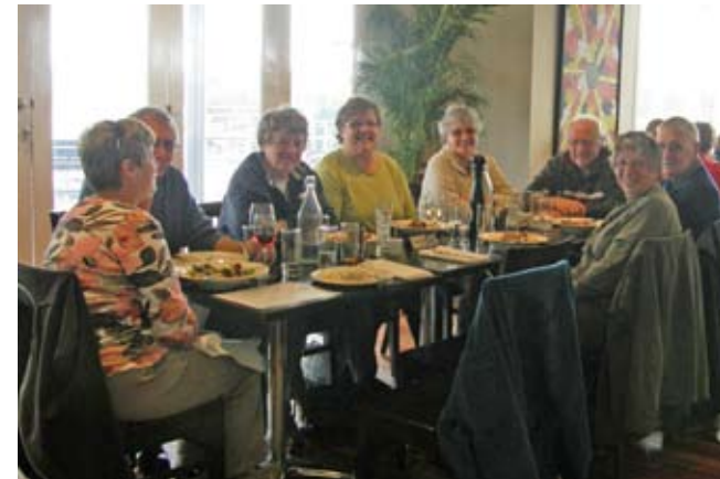
CLUB OUTING to SALISBURY WETLANDS followed by lunch at the WATERSHED CAFE

Our next meeting will be held at 7.30 pm on Friday 18 June 2010 at the Camden Park Community Centre, 7 Carlisle St, Camden Park.