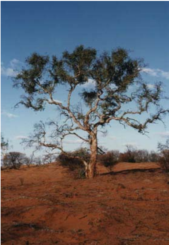
The photograph above of Jack's tree was taken in August 1996 six months after the fire.