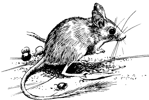
Spinifex Hopping Mouse