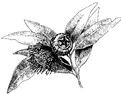
Ooldea Mallee